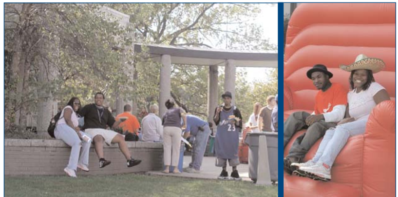
It's fall in the Bluegrass and that means Fall Fest time at BCTC. A Fall Fest, hosted by Student Government, was held on all six BCTC campuses. On Cooper Campus (pictured above) around 1,000 students turned out for the annual event on October 3. Students were treated to a free lunch and a chance to participate in several blowup activities including Sumo Wrestling, Gladiator Jousting and scaling the Velcro Wall.