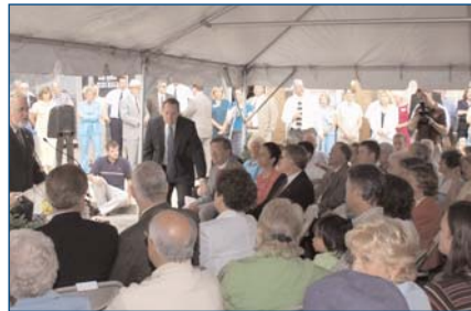
More than 125 people attended the grand opening of the new Lancaster Higher Education Center in June.

• Lancaster Higher Education Center: BCTC and Eastern Kentucky University have teamed up to open the new center, located on the Courthouse Square in Lancaster. Classes offered for Fall 2006 included education, nursing and business.