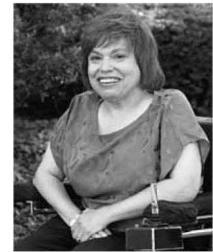
Judy Heumann b. 1947

From 1993 to 2001, Heumann served as Asst. Secretary to the Office of Special Education and Rehabilitation Services at the U.S. Department of Education. Heumann who contracted polio at the age of 18 months states, "Disability is not a tragedy but a normal part of life. It is a tragedy when disabled people are excluded from opportunities which would enable them to be part of the economic mainstream of society. I have committed my life to enabling disabled individuals and their families to have the same hopes and dreams as we have for nondisabled people."