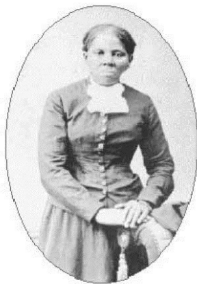
Harriet Tubman 1820 - 1913

Tubman was a slave born on a plantation in Maryland. When she was thirteen years old she threw herself between a fellow slave and the plantation overseer who was about to whip him. The overseer struck her on the head. For the rest of her life she had a form of epilepsy. Tubman escaped slavery at age 29 and dedicated the rest of her life to rescuing slaves and to civil rights, including women's suffrage.