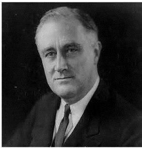
Franklin Delano Roosevelt 1882 - 1945

Franklin Roosevelt served for 3 terms as President of the United States and helped pull the country out of the depression through social programs. He also led the U.S. through World War II. Due to polio, FDR could not walk unassisted. Unfortunately, because of the times, he felt he had to hide the extent of his disability from the American public.